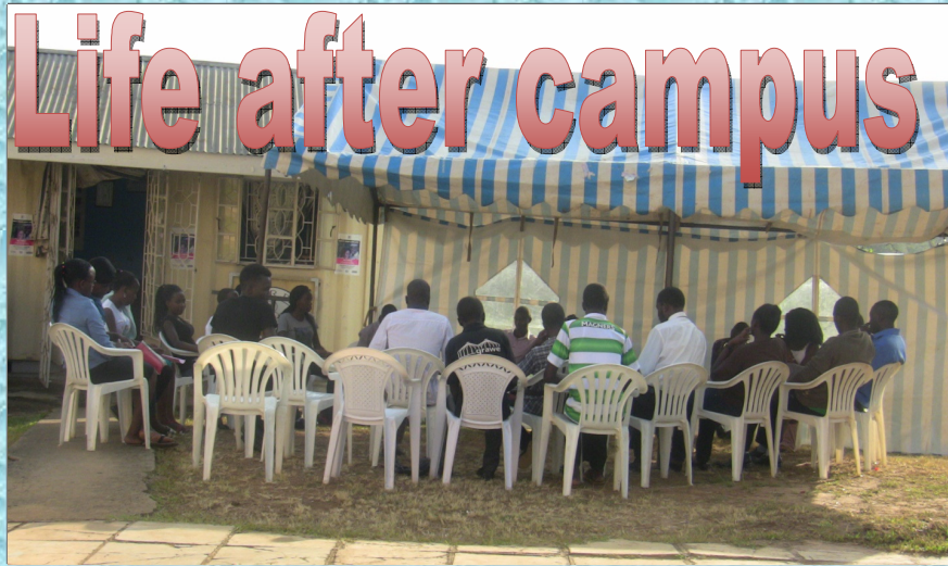
Peer Educators and Peer members discussing about life after campus

In the Focus Group discussion that happened on 30 th Jan 2017. Peers discussed on life after campus. Peers asserted that life after campus is very tough compared to life in campus. Life after campus calls for more responsibility and needs a lot of planning since it's trickier. Life outside campus needs hard work in all aspects but inside campus hard work is only towards education.